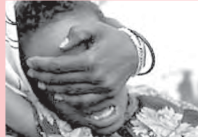
The suffering of a child during FMG

There was a girl in Grade 4 who was a good student and at the same time very active. She lived in an area where genital mutilation had been widely practiced. In recent years, people living in the area had learnt the harmful effects of such a practice and agreed to stop genital mutilation. However, there were a few families who wanted to retain this harmful practice. The girl unfortunately belonged to such a family. When she was eleven, this girl faced genital cutting. She was morally and physically damaged to such an extent that she was unable to continue her education. Her dream to become a medical doctor could not happen due to the wrong decision her parents made.