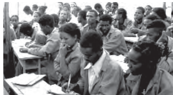
Students learning in class room (formal learning)

knowledge you obtain will serve as a compass to guide you in the right course of life. Knowledge is an instrument that serves to avoid Harmful Traditional Practices (HTP) such as female genital mutilations or cutting, abduction, early marriage or teeth extraction. Such practices have a negative effect on health and could cause social problems. You can teach people to avoid such practices as they are obstacles for development. Through knowledge, there are many ways in which you can help yourself and your country.