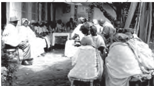
People gathering to discuss issues of concern (informal learning)

You need knowledge in order to understand more about yourself and your surroundings. The