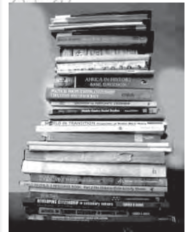
Books are one of the sources of knowledge

Form groups to analyze the information and data shown in the table to determine the following: